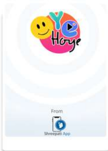
Oye Hoyo (Social Video sharing)