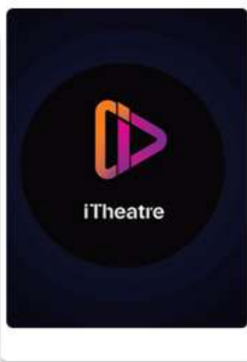
I-Theatre (OTT Platform)

Some of the Mobile Apps recently developed by us: